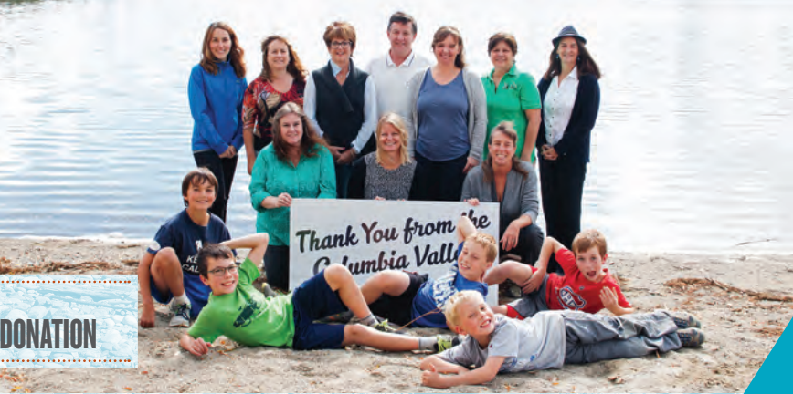
Recipients of the W. BRETT WILSON & FAMILY COMMUNITY DONATION

Columbia Valley Arts Council Kootenay Savings Community Foundation PLG Holdings Inc.