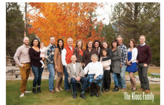
The Kloos Family