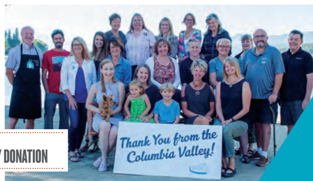
Recipients of the W. BRETT WILSON & FAMILY COMMUNITY DONATION

Aviva Community Fund Calgary Foundation (Hay Family) Friends of the Invermere Public Library Gift Funds Canada Kootenay Savings Community Foundation PLG Holdings